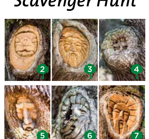
There are seven tree spirit locations on public property. Keep searching because these mysterious creatures continue to surprise us... who knows where they will show up next!