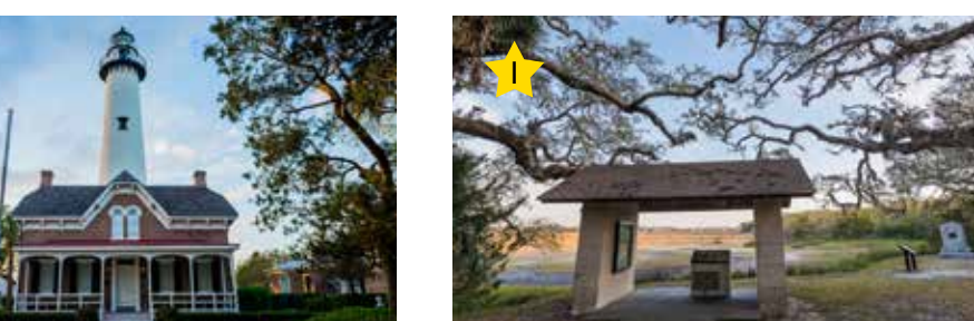
ST. SIMONS LIGHTHOUSE

MUSEUM Located near the village and pier, this is one of only five surviving light towers in Georgia. Experience St. Simons Island's most iconic landmark as you climb the 129 steps to be rewarded by breathtaking views of the Golden Isles 610 Beachview | 912.638.4666