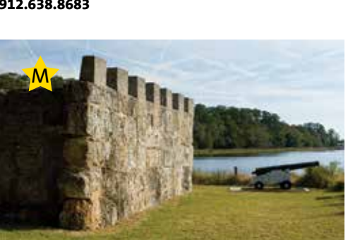
FORT FREDERICA NATIONAL MONUMENT

Established by General James Oglethorpe in England, Fort Frederica was used to protect the Southern boundary. Today, the archaeological remnants of the fort still remain and are protected by the National Park Service. Free tours are open to the public daily along with a visitor center filled with artifacts and a gift shop.