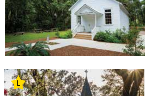
CHRIST CHURCH, FREDERICA

nary contributions during World War II. Through immersive exhibits and interactive experiences, visitors will learn about blimps on anti-submarine patrol, radar training to direct fighter pilots, building Liberty ships to supply troops overseas, and much more. 4201 1st Street | 912.634.7098