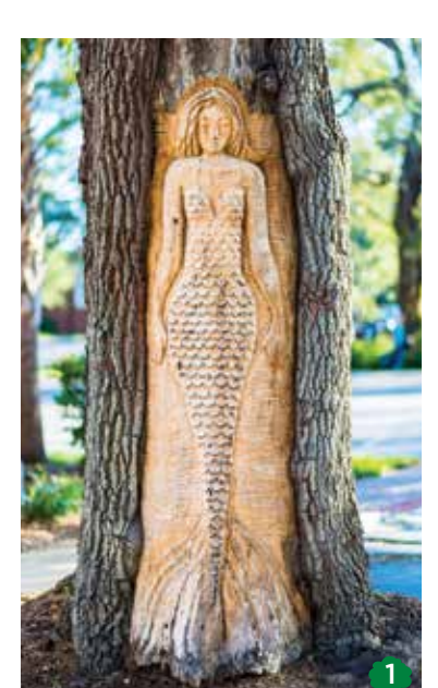
Tree Spirit Scavenger Hunt

The oldest remains on this world-class complex of archaeological sites are the numerous shell rings and middens that date back to 2500 B.C. The site also contains the remains of an 18th-century house along with a large plantation-era home, outbuildings, and slave quarters built in the early 1800s. Open to the public Saturday, Sunday, and Monday from 9 a.m. - 3 p.m. Lawrence Rd. | 912.638.9109